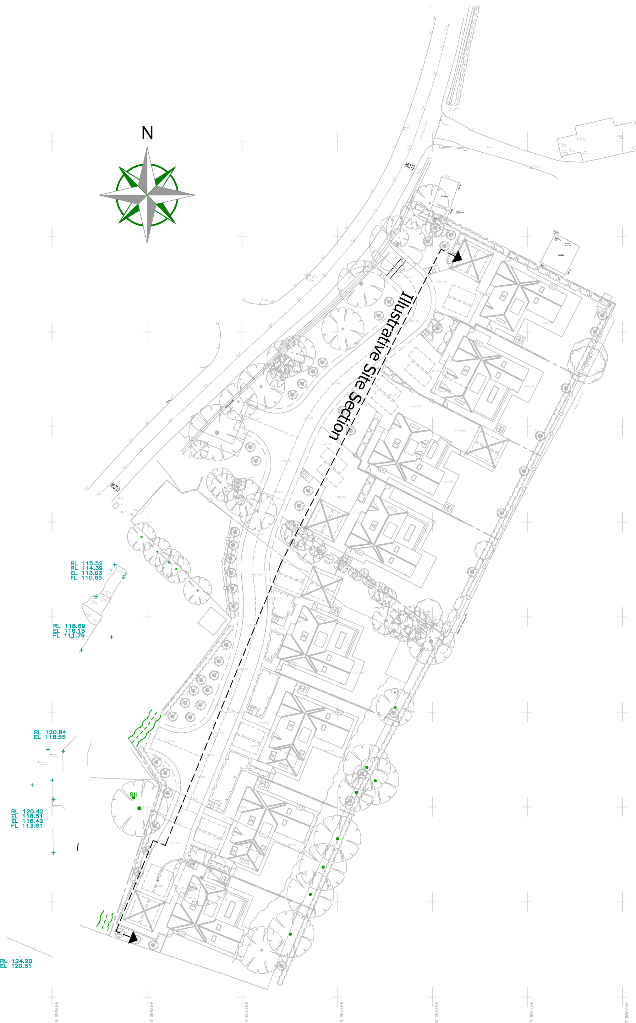
Site Layout - Illustrative Scale 1:500