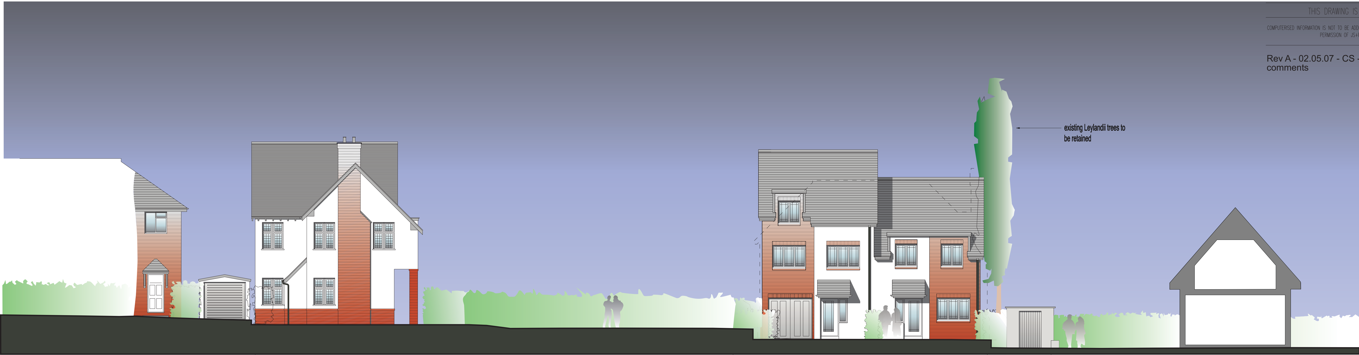
BUTT LANE CLOSE ELEVATION