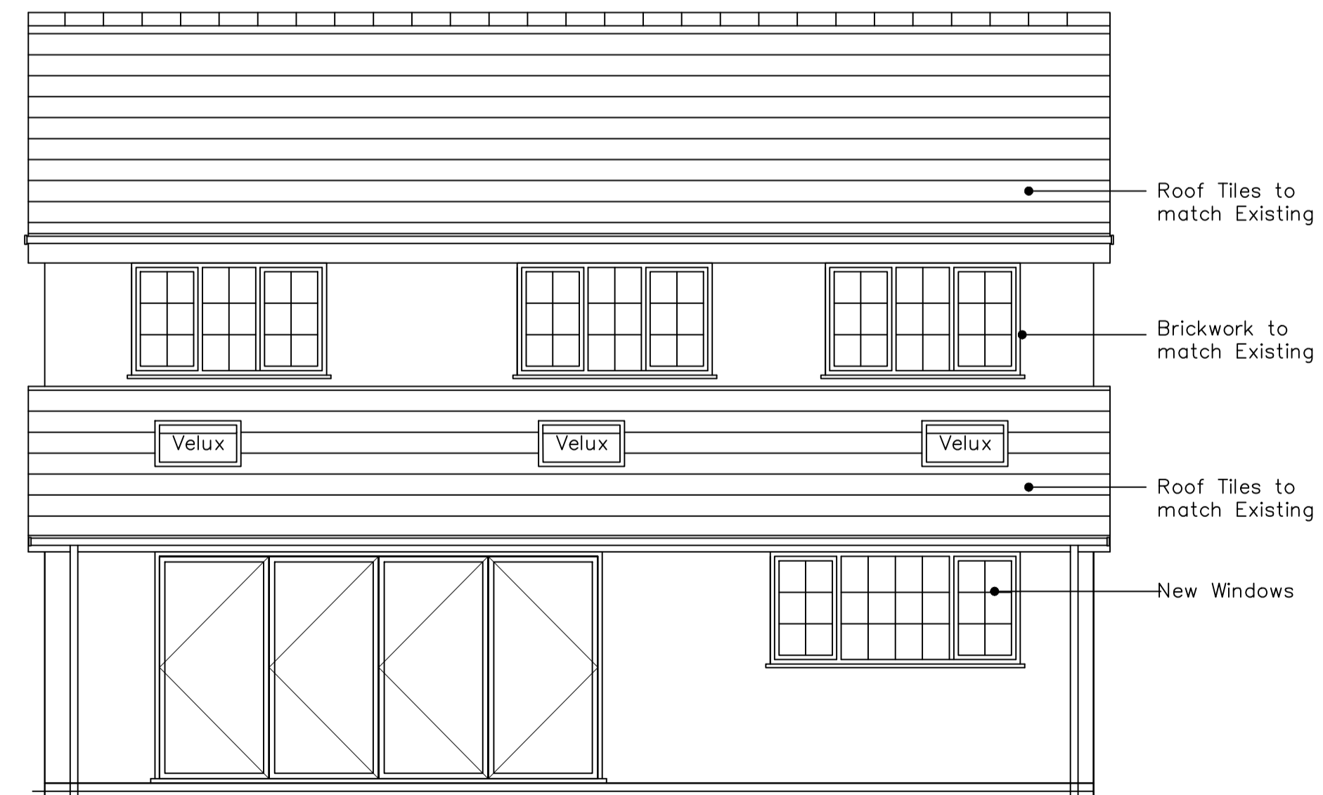
Proposed Rear Elevation Scale 1:50