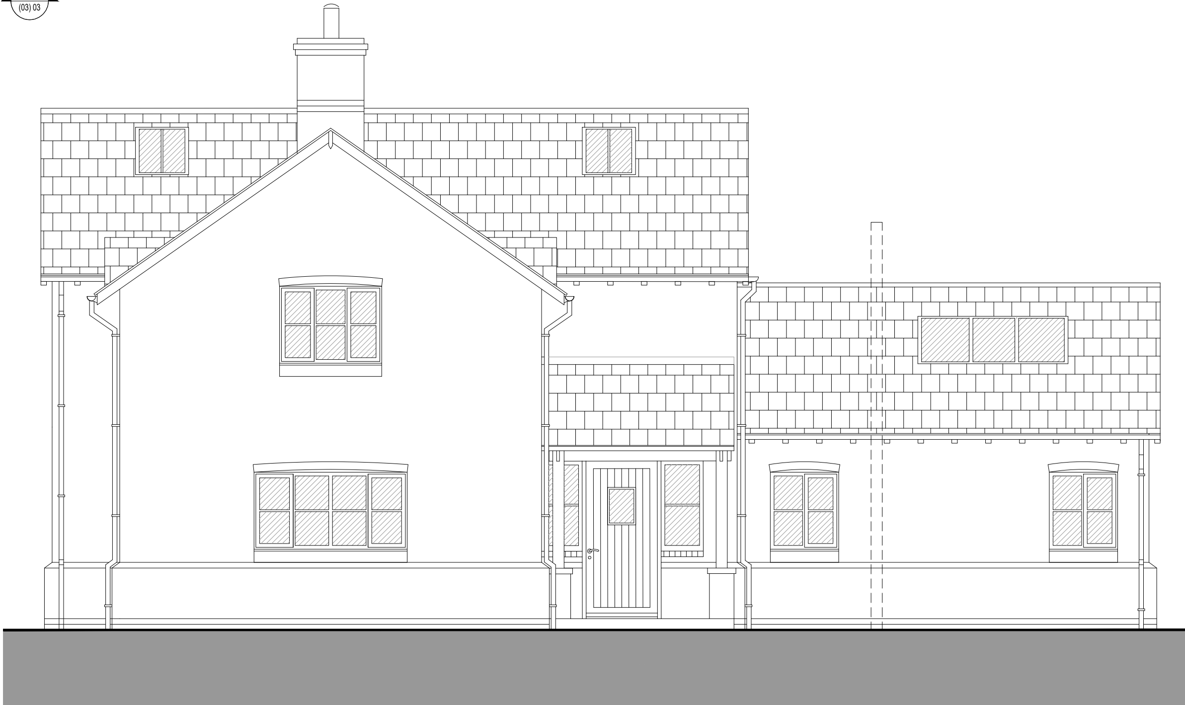
Elevation A As Proposed Scale 1:50