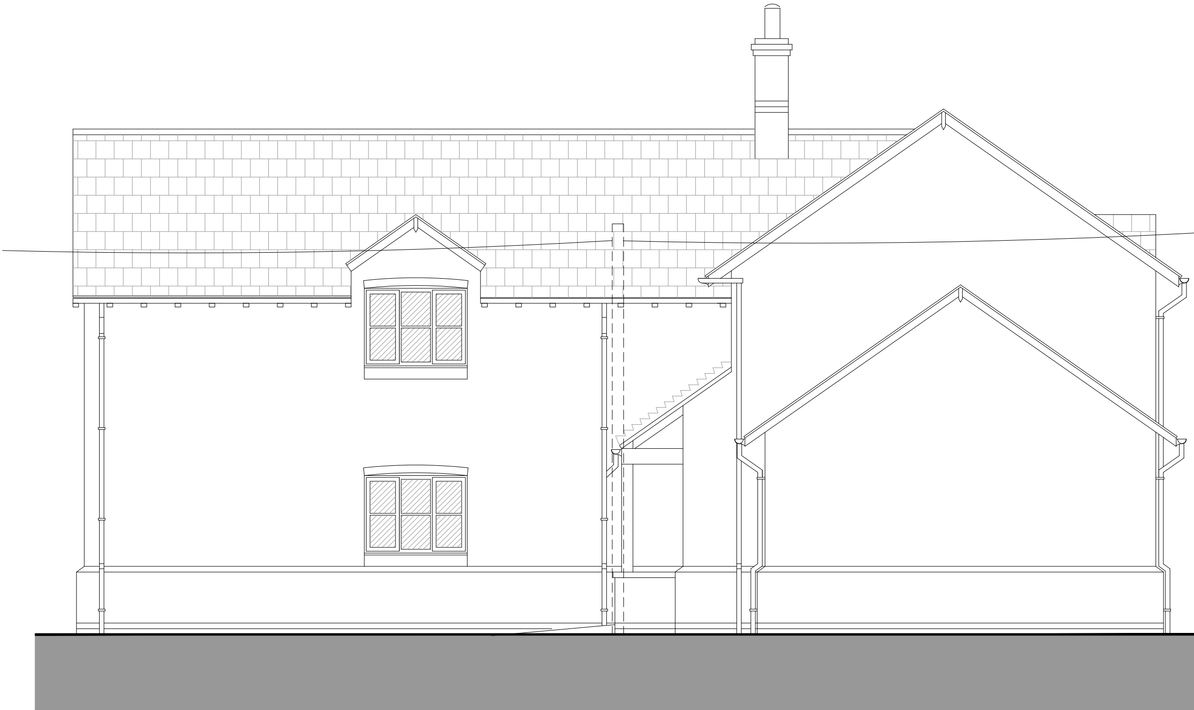
Elevation B As Proposed Scale 1:50