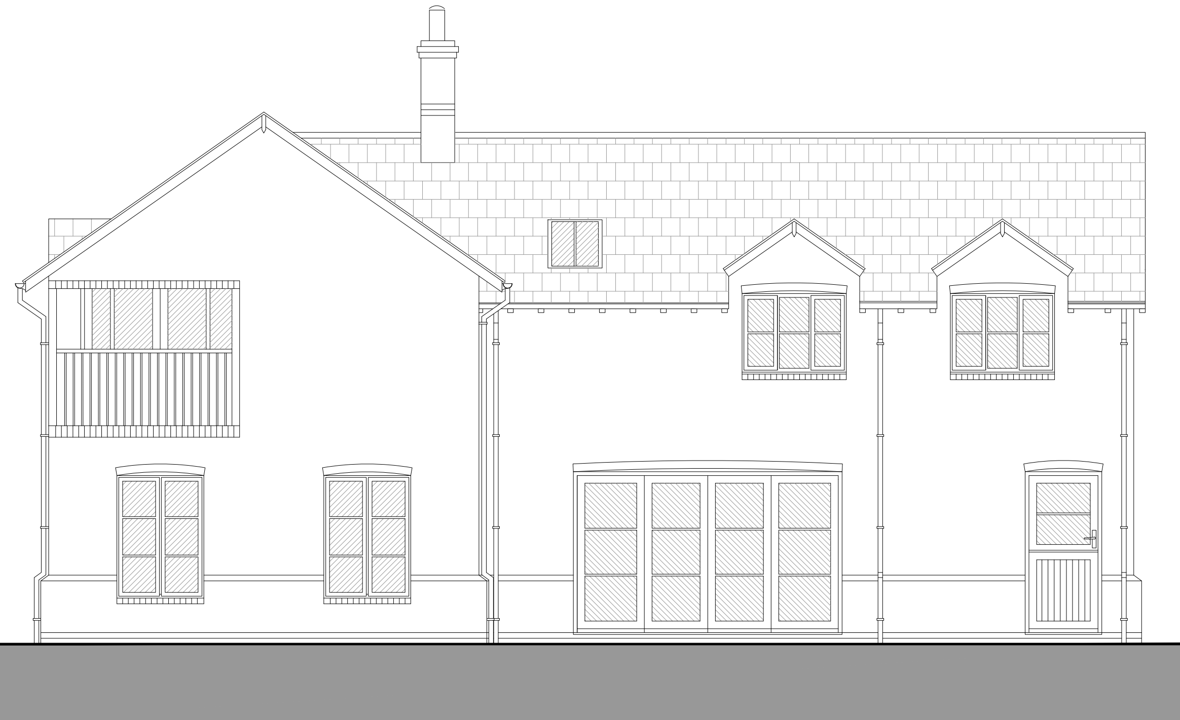
Elevation D As Proposed Scale 1:50

A 18.12.24 Amended width of utility widow KW