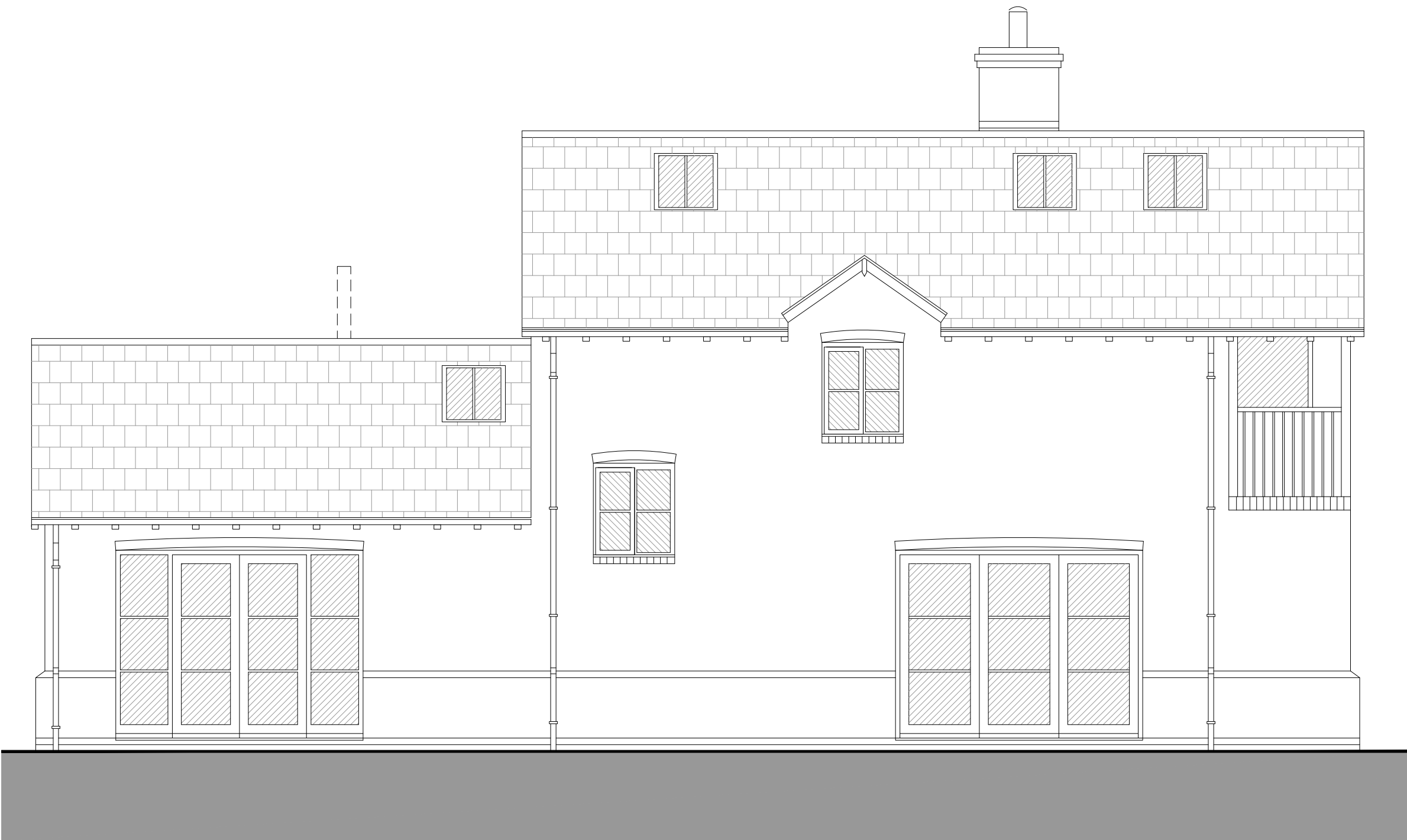
Elevation C As Proposed Scale 1:50