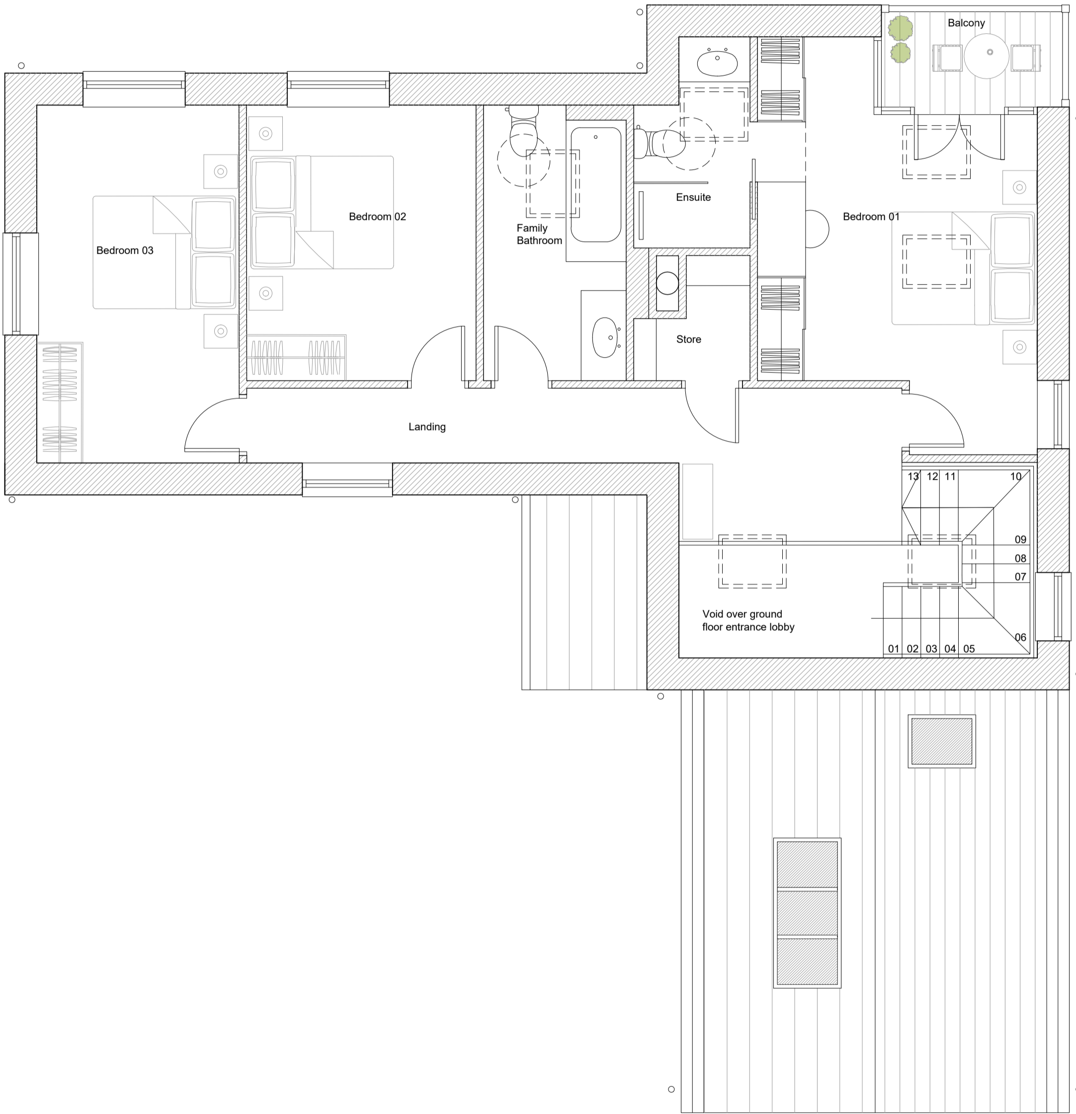
First Floor Plan As Proposed Scale 1:50