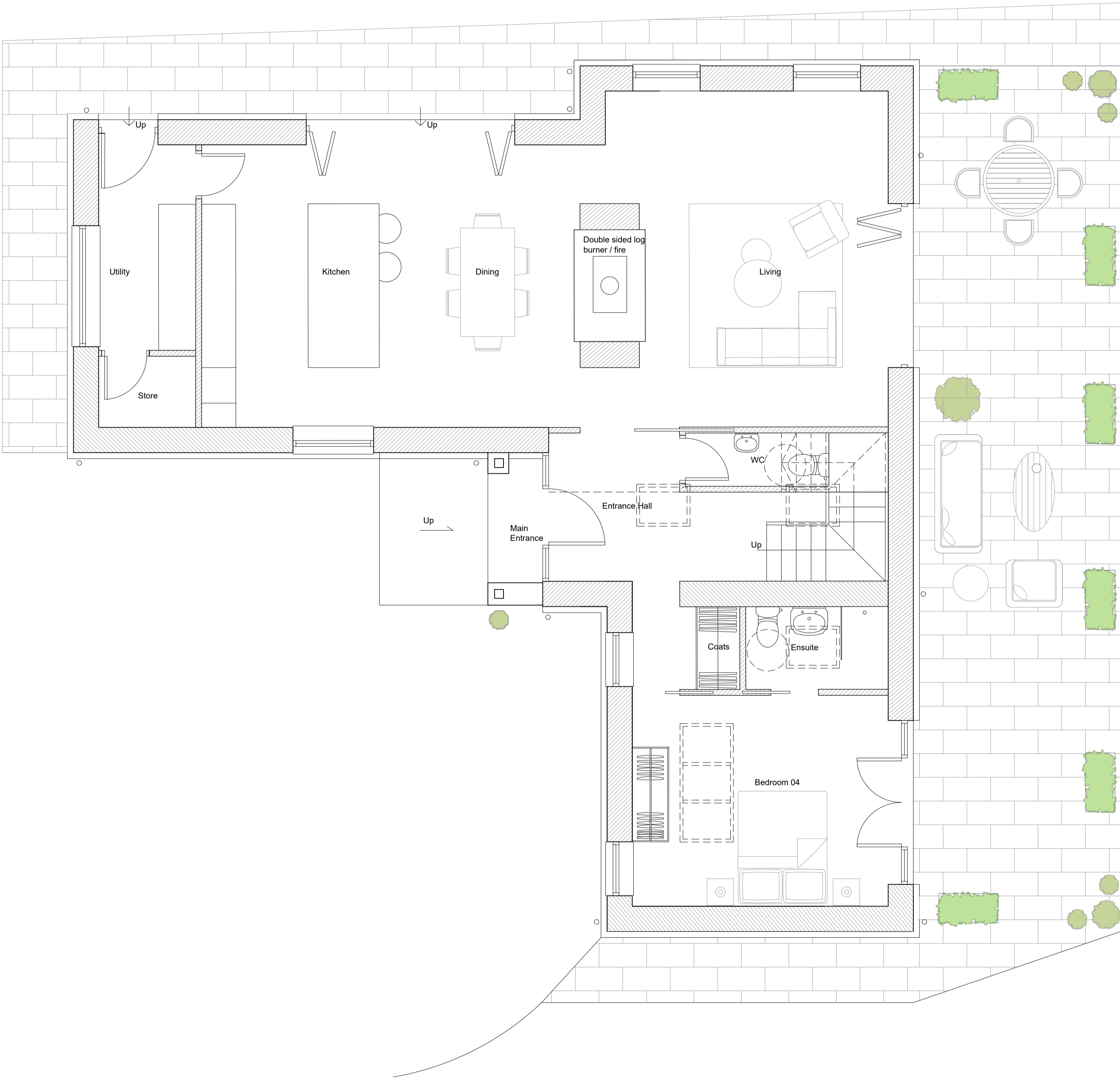
Ground Floor Plan As Proposed Scale 1:50