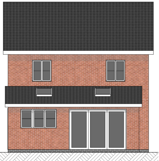
West Elevation - Rear