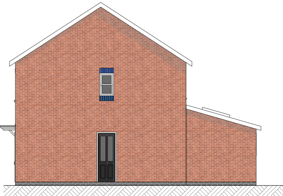
North Elevation - Side